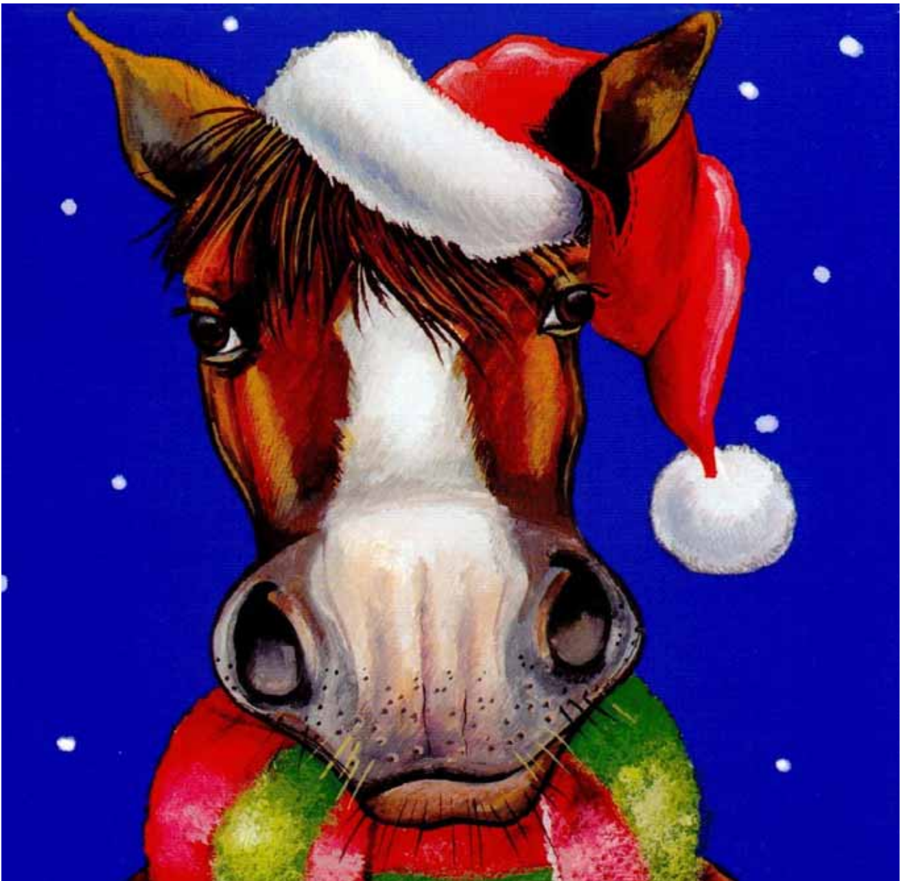
One of the four different greetings cards designed and sold by a Dutch agricultural retailer. Part of the proceeds goes to SKBN members

.....and a happy New Year to you all !!!