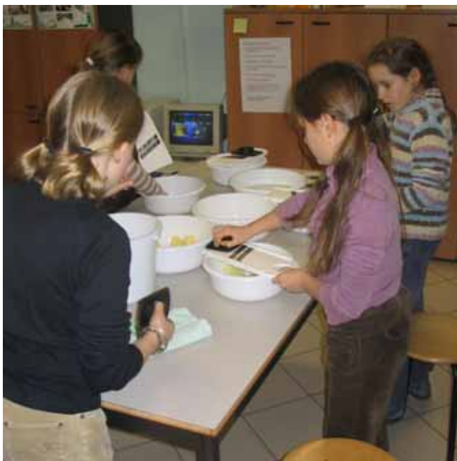
from potatoes to crisps in Pietersheim City Farm

The city farm is a tourist attraction for the whole region, which includes the Netherlands and Germany. There are many walking routes in the neighbourhood. The farm is situated near the Dutch border a short distance from Maastricht in the south of Holland. For many years there has been close co-operation between the Centre for Environmental Education in Maastricht, the four Maastricht city farms, animal park, animal ambulance and the animal shelter.