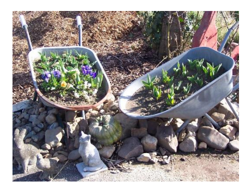
Many city farms ask visitors to bring spent bulbs to the farm for a flower explosion in the next year.