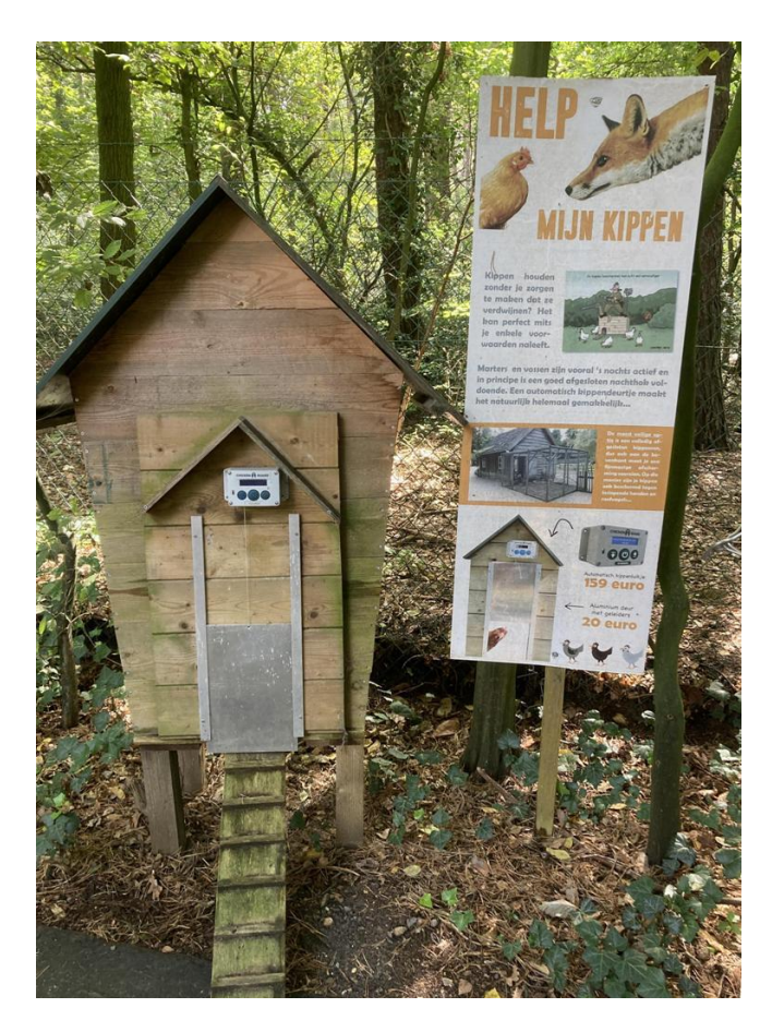
Automatic hatch with a timer on chicken coop to protect the chickens against foxes, martens etc. <a href="https://www.natuurhulpcentrum.be">www.natuurhulpcentrum.be</a>